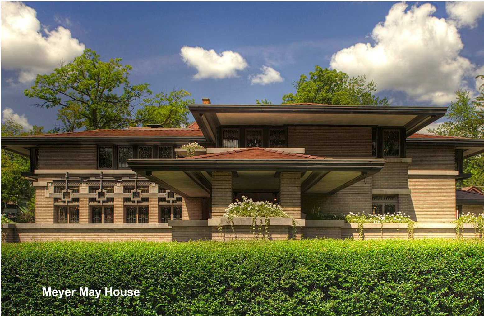
Meyer May House