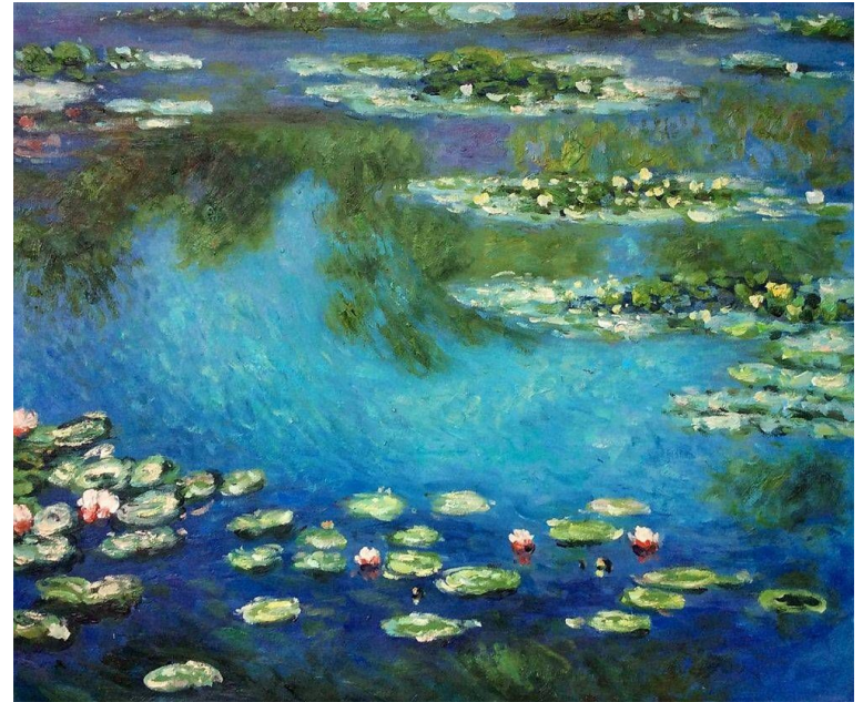
Claude Monet Water Lilies, 1914